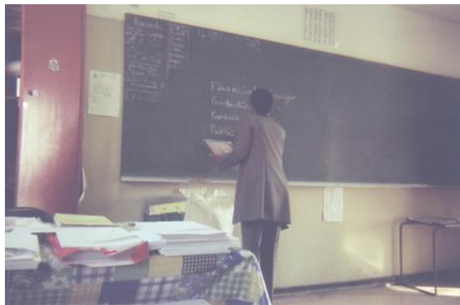
Figure 5. An inspiring teacher

Masculine identity was conceptualised as identity positioning in relation to hegemonic masculinities as privileged or centrally voiced positions. Broadly, the findings suggested that masculine identity positions could be dialogued and ‘redialogued’ at multiple levels – personal subjectivities, group and collective identities and through social narratives.