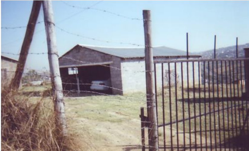
Figure 3. Outsider perspectives

Barriers of various kinds were recurrent in the photographic data and the biographical drawings, which prompted the idea of the ‘walled solution’. The outsider perspective of photographs and interview narratives sometimes positioned the viewer or interviewer outside contexts such as homes, the clinic and commodities. Photographs ‘on the inside’ prompted discussion from an interiorised perspective, facilitating reflections on life as a young man within a family, a school or peer group. 56 of the 80 photographs were of objects and environments rather than people, suggesting a sense of isolation and instrumentality which was also voiced in the interviews and depictions of losses and barriers in the biographical drawings. Displays of objects were frequent, often relevant to social and interpersonal activities, such as football team posters, displays of personal clothing items, computers and mobile phones.