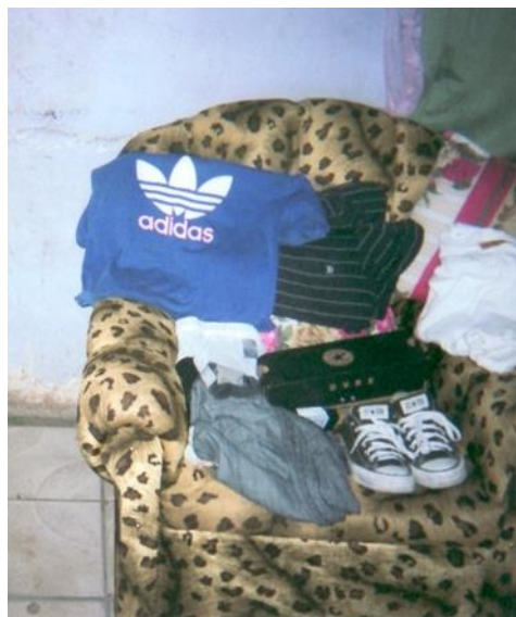
Figure 4. Displays of iconic items

Masculine identities were both actively positioned by the boys and sometimes passively positioned by collective narratives or hegemonic imperatives. Positioning was influenced by others, for example, by alternate perspectives such as the viewpoint of a traditional grandfather, an inspiring teacher or an innovative experience. The presence or absence of others and changing circumstances made positions available or constrained positions. For example, a participant became the ‘man of the house’ in his father’s absence. Another participant felt ‘boosted’ when his father encouraged his school efforts. At times, the boys were very active in negotiating positions in relation to hegemonic imperatives, ideals and practices, for example, participants presenting an autonomous ‘I-position’ in resistance to hegemonic imperatives to use alcohol and drugs. Some of the individual positioning was unstable and unanchored in contexts or collective identities, rendering the counter-hegemonic position fragile.