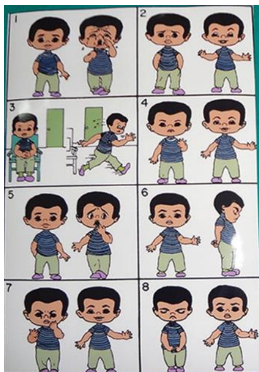
Figure 1. The Venham Picture (Veham, 1979)

Before the dental injection, the level of anxiety was predicted using the Venham Picture Test. The test is easy to administer and score, as it consists of eight cards with pictures of children in various dental situations. There are two figures on each card, one in which a child appears happy and the other one in which he looks distressed. The children were asked to point at the figure that represented their feelings at that moment. A score was recorded for each card when the "high fear" picture was selected and summed to give total out of eight. Higher scores indicate greater fear.