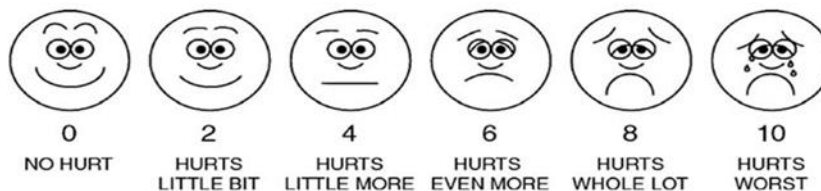
Figure 3. Visual Analogue Scale (VAS) (Wong et al., 2001)

The scale shows a series of faces ranging from a happy face at 0-"No hurt" to a crying face at 10-"Hurts worst". The children had to choose the face that best described how they felt.