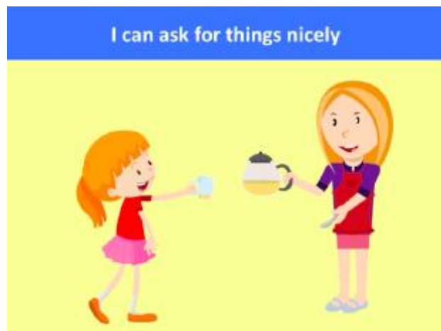
Figure 1. Example picture of the skill card for the “I can ask for things nicely” skill

Each participating class will receive one set of skill cards. The skill cards consist of the name of the skill, a picture of the skill, and a detailed explanation of the skill. The teacher will discuss each skill with the whole class, so that all students understand the meaning of the skill and how to perform it. The skill cards can be put up on the classroom walls. The figure 1 below illustrates what a skill card looks like.