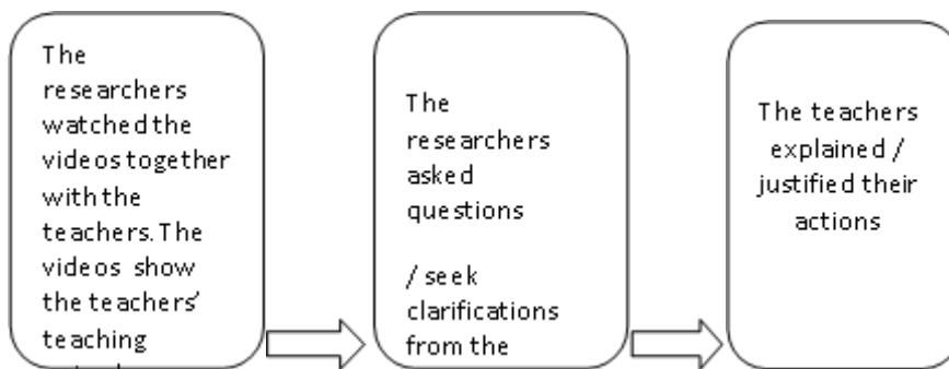
Figure 1. The Process of the Stimulated Recall Sessions