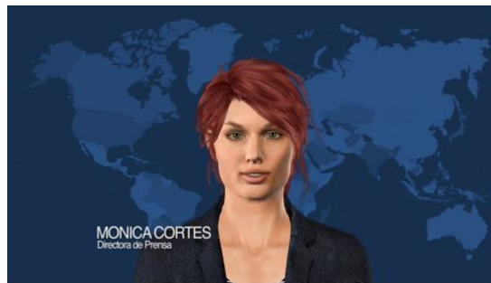
Figure 1. A newscast introduces the threat of a cyberattack

The story The Fourth Revolution became the set aspect of the network and was introduced to a group of 24 students via a WhatsApp group using the same name. A brief introduction by university officials was followed by a cinematic-type opening followed by media created specifically for the experience. Several newscasts were implemented to introduce topics as shown in figure 1. The teacher was introduced via a newscast, and the first session was announced as the presentation of an expert within the story at the time of the first synchronous session.