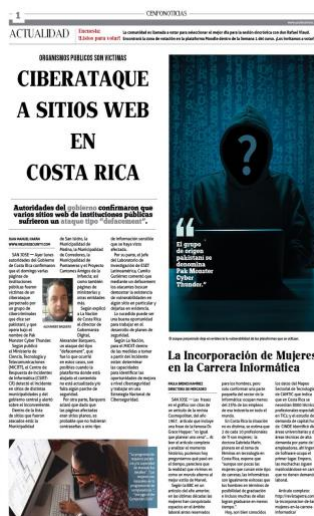
Figure 2. News presented in a realistic newspaper format

In addition, various newspapers were also designed to complement the illusion of an immersive narrative, as shown in figure 2. These included messages that would otherwise be posted on the LMS. All articles were accurate and made part of university blogs, presentations on the role of women in computer science, as well as information on topics relevant to the student population such as demand for computer engineers and the latest industry trends.