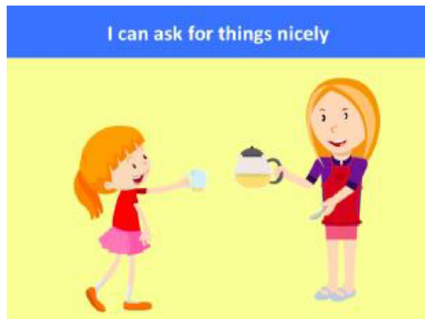
Figure 1. Example picture of the skill card for the “I can ask for things nicely” skill

Each participating class will receive one set of skill cards. The skill cards consist of the name of the skill, a picture of the skill, and a detailed explanation of the skill. The teacher will discuss each skill with the whole class, so that all students understand the meaning of the skill and how to perform it. The skill cards can be put up on the classroom walls. The figure 1 below illustrates what a skill card looks like.